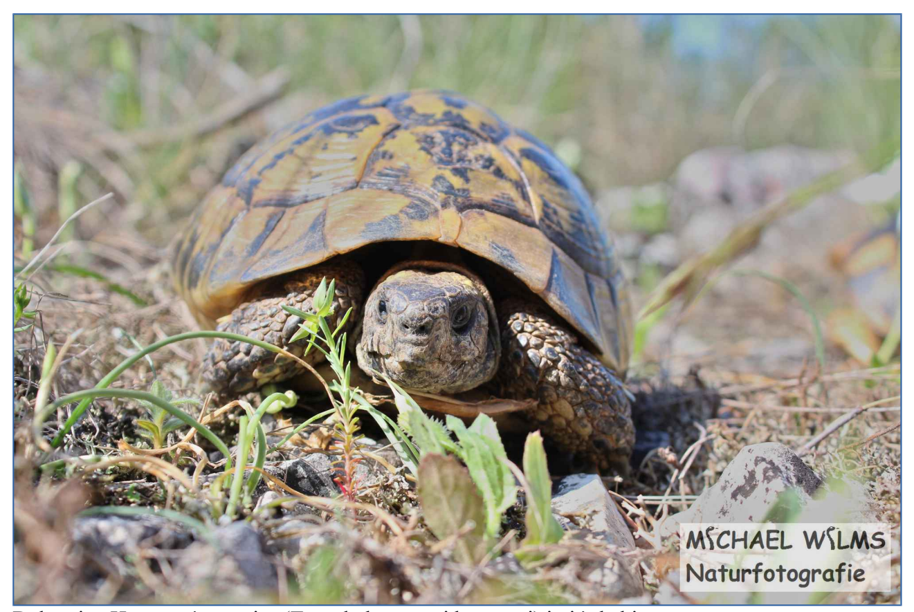
Dalmatian Hermann's tortoise (Testudo hermanni boettgeri) in it's habitat