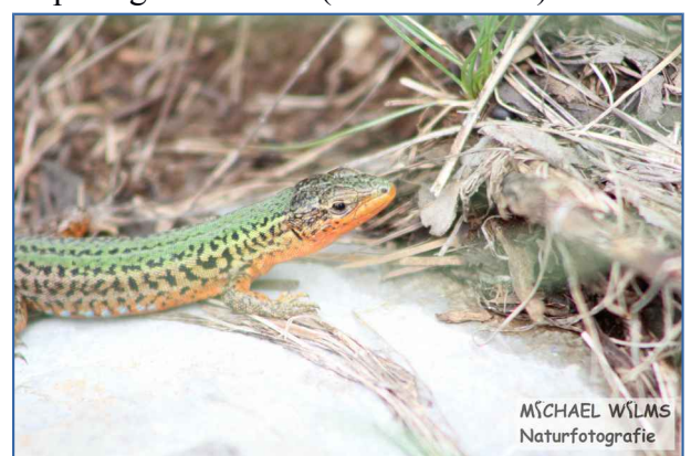
Dalmatian wall lizards (Podarcis melisellensis)