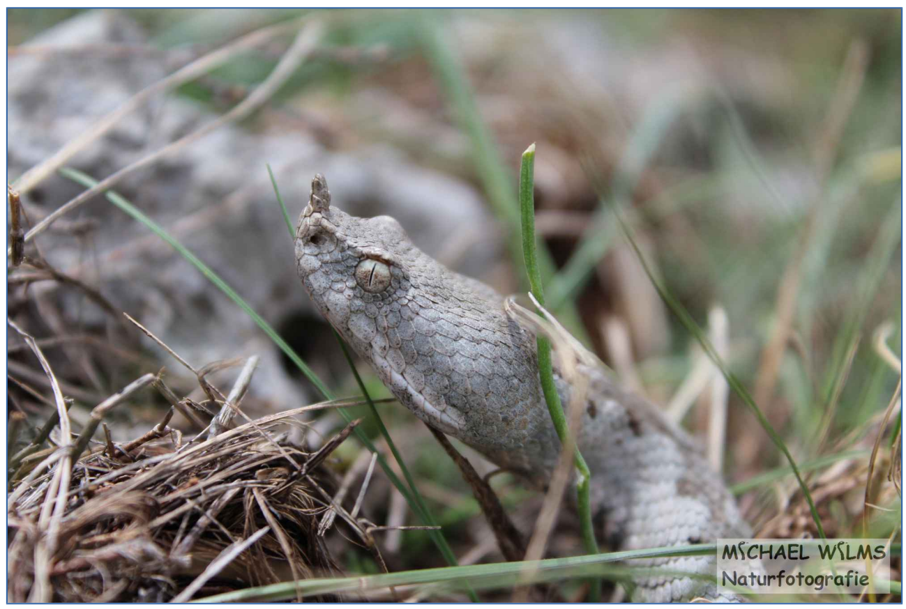
Nose-horned or sand viper (Vipera ammodytes) in higher mountainous region of the Paklencia national park (Velebit mountains)