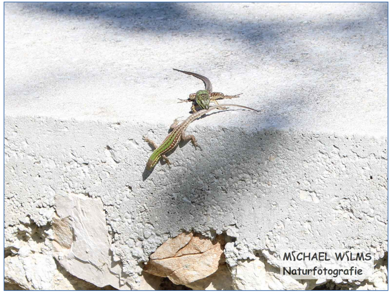
Italian wall lizards (Podarcis sicula)

The baby dice snake was curled up in the middle of the trail and was implemented by me at appropriate place.