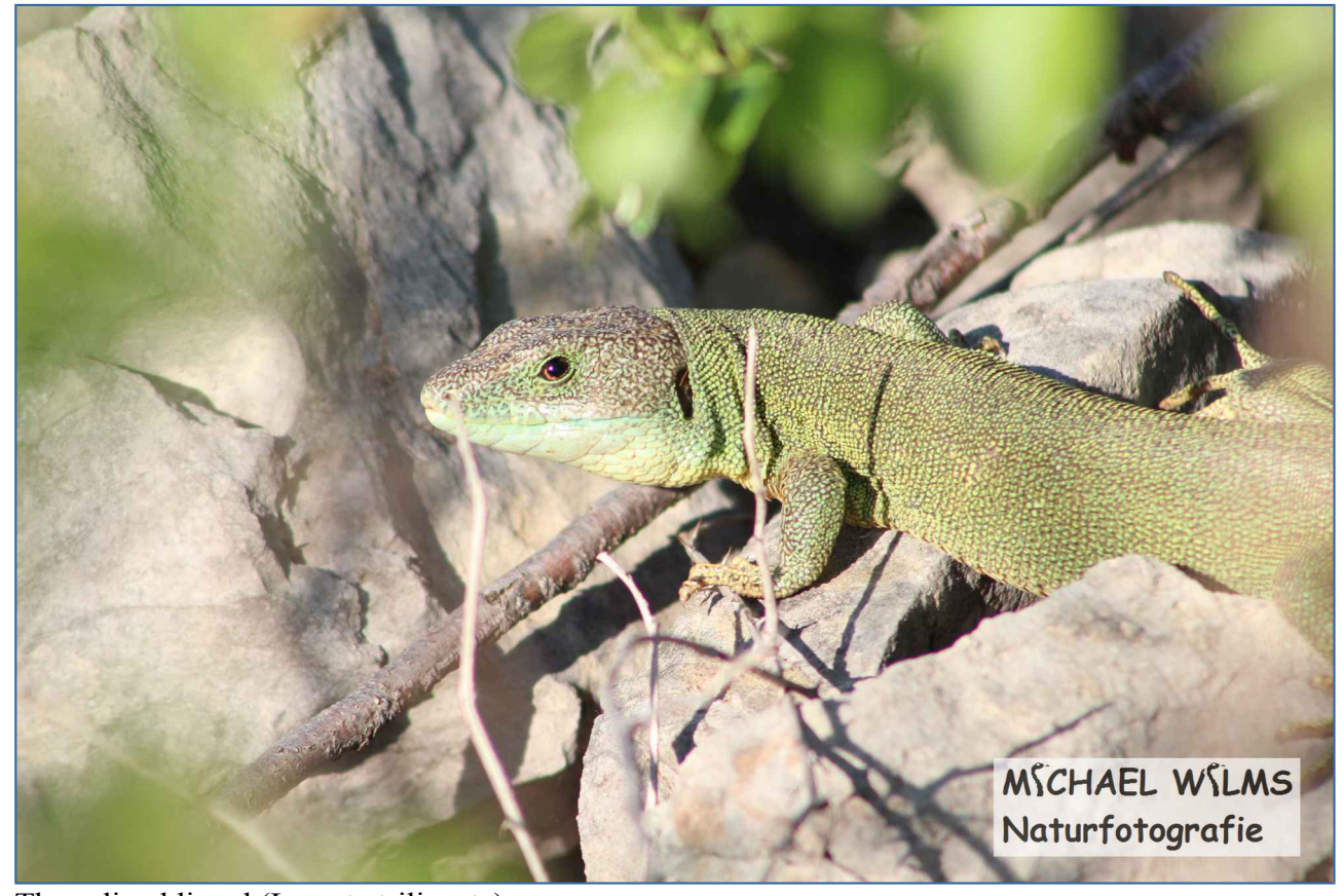
Three-lined lizard (Lacerta trilineata)