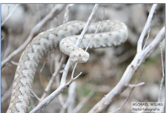
Nose-horned or sand viper (Vipera ammodytes) in deadwood in it's habitat in the Velebit mountains (left and above)