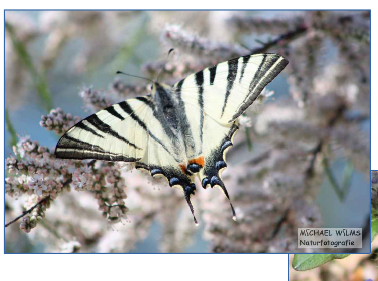
Scarce Swallowtail (Iphiclides podalirius)

Southern festoon butterfly (Zerynthia polyxena)