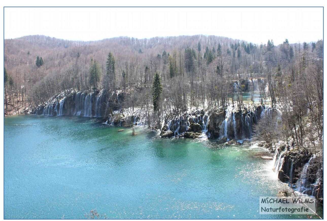
National park Plitvice lakes in April, in the higher regions there are still snow rests between the trees and the meltwater flows down everywhere