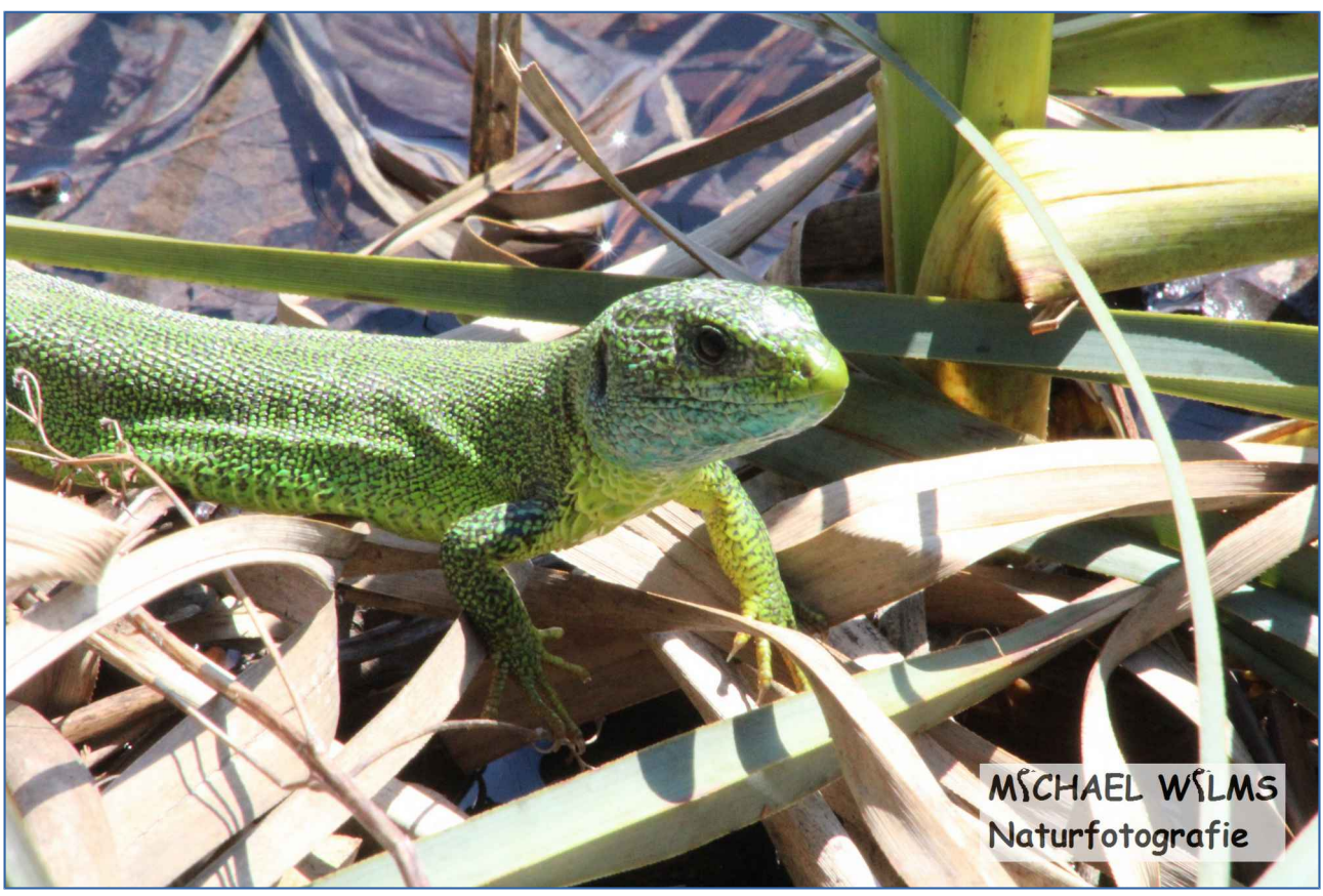
Eastern green lizard (Lacerta viridis) not far away of snow rests in NP Plitvice lakes in April