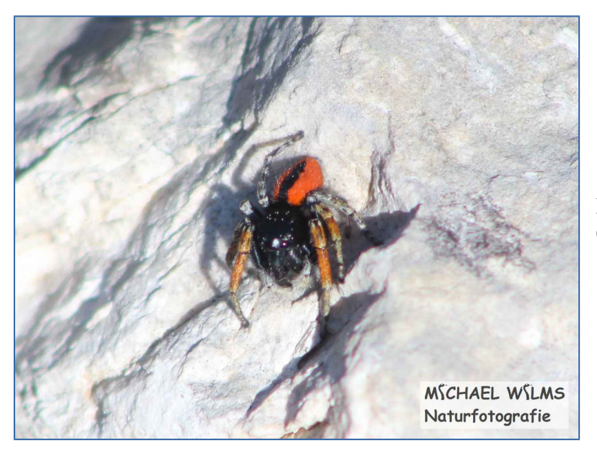
Red bellied jumping spider (Philaeus chrysops)