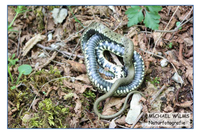
Grass snake (Natrix natrix ssp.) in Paklenica national park in a valley near a creek