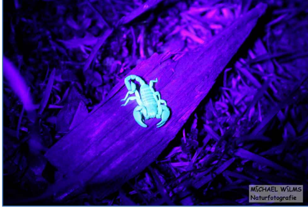
European scorpion (Euscorpius sp.), on right in the night under UV light