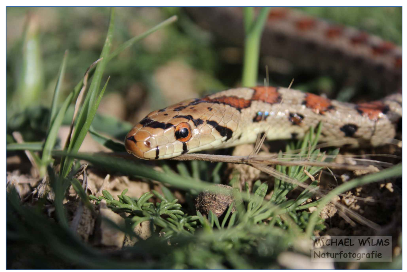
Leopard snake (Zamenis situla) on the island Pag