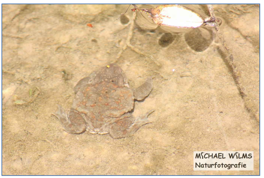
Indefinite toad on river bed at a quite river side arm of the Krka