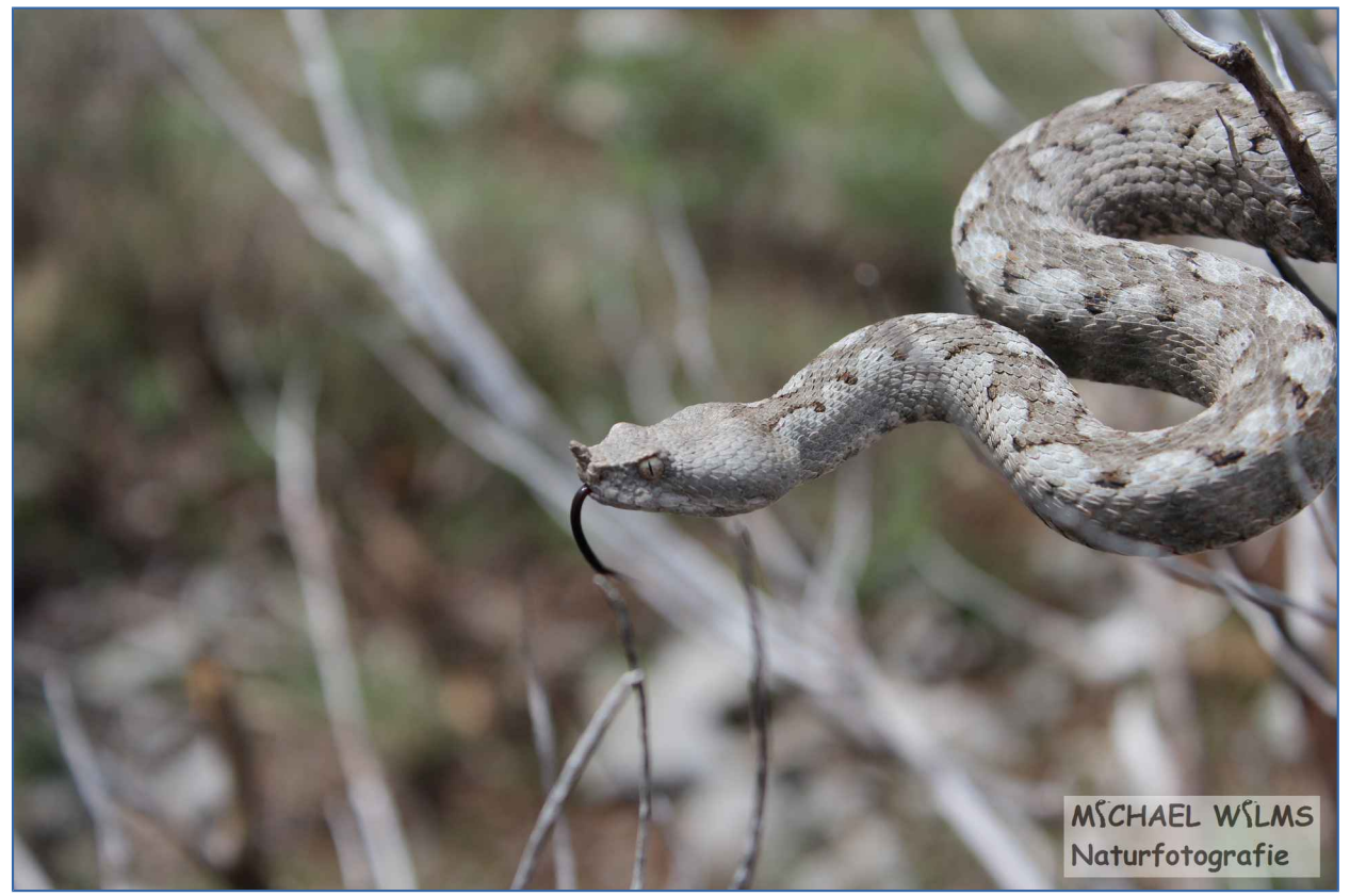
Nose-horned or sand viper (Vipera ammodytes) in branches