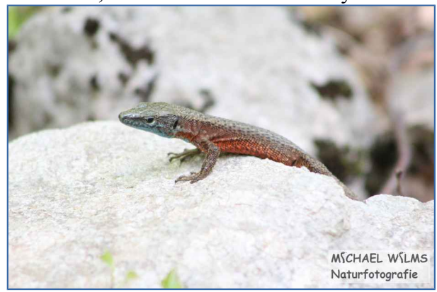
Blue-throated keeled lizard (Algyroides nigropunctatus)