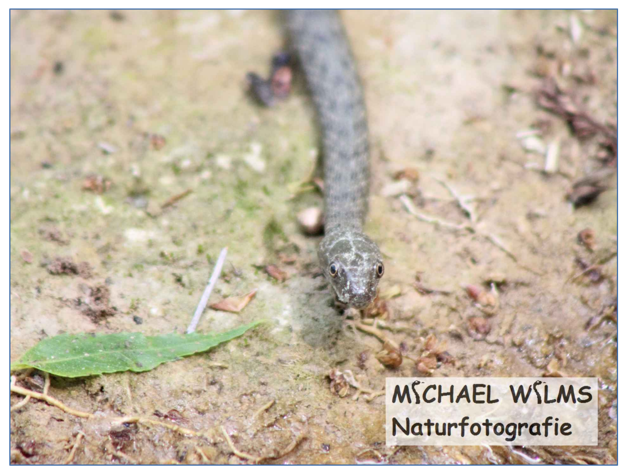
Dice snake (Natrix tesselata), juvenile