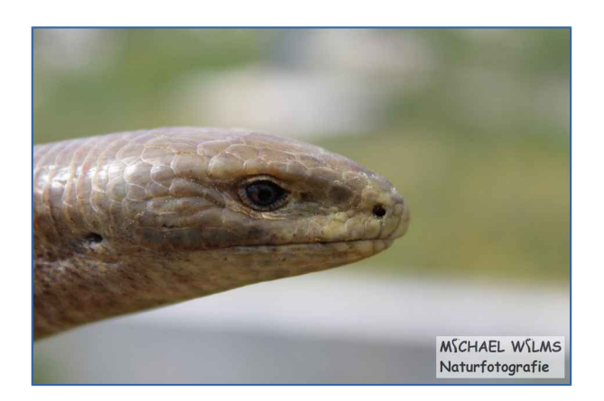
Sheltopusik (Pseudopus apodus) or European legless lizard