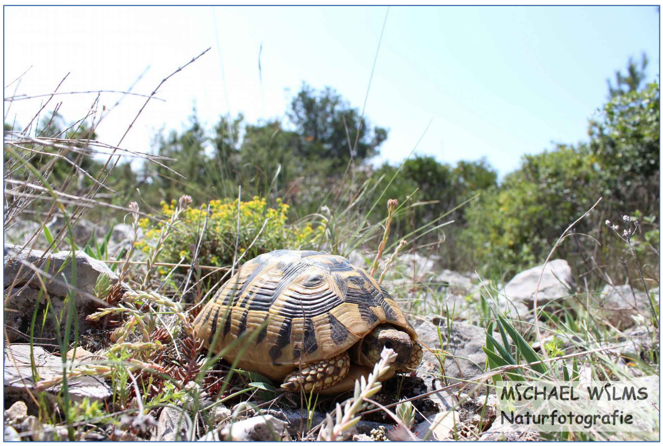
Dalmatian Hermann's tortoise (Testudo hermanni boettgeri) in it's habitat