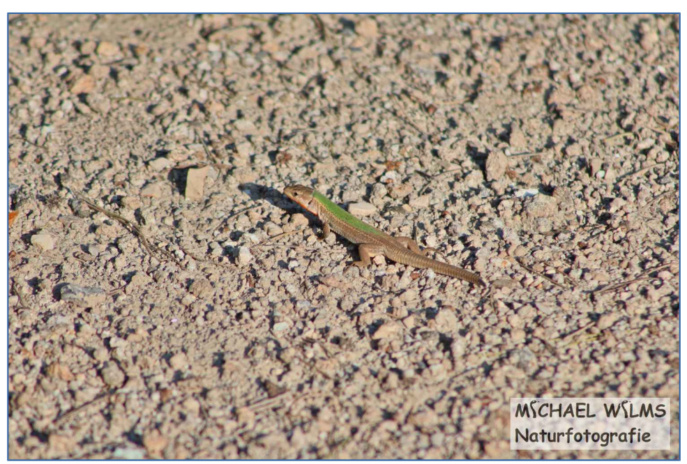
Dalmatian wall lizards (Podarcis melisellensis)

Finally, I found a young Four-lined snake (Elaphe quatuorlineata) in juvenile coloration only a few meters away from the place where I discovered the Leopard snake (Zamenis situla) a day before. The next morning I found at the same location a Balkan whip snake (Hierophis gemonensis).