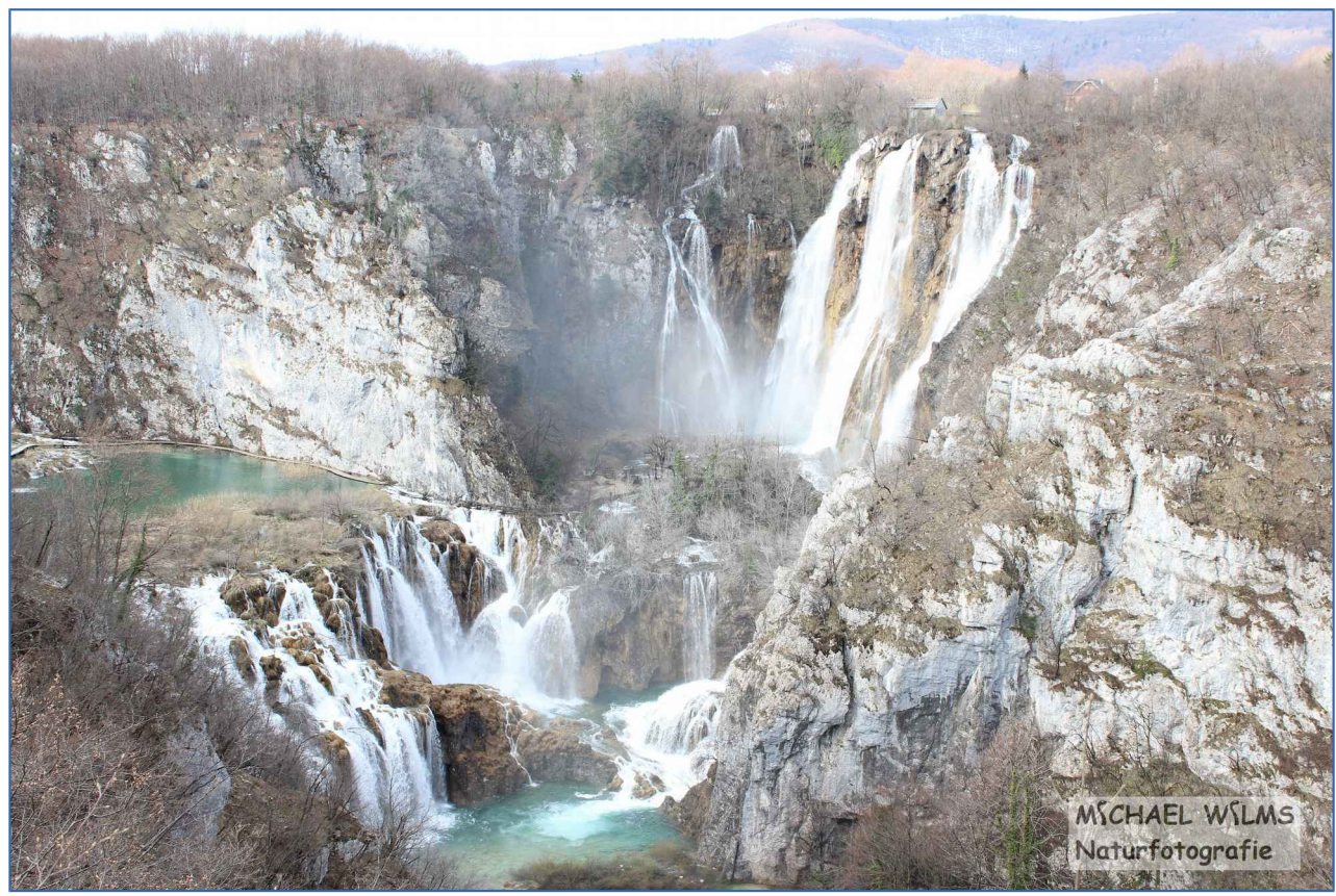
National park Plitvice lakes, Veliki Slap (highest waterfall), with 78m hight the highest waterfall of Croatia

The following day, April 15th, we visited the national park Plitvice Lakes. The nature and lakes with waterfalls were breathtaking. As a result of the long winter many of the lower paths directly on the lakes were still flooded and partially impassable. Nevertheless we partially walked a flooded path and even had to take our shoes off in some places and walked barefoot through the ice water over the sharp stones. There was still a lot of snow on the upper lakes. So we saw the waterfalls probably more rapid than in high season and maybe also some minor waterfalls beside do not exist in the summer. The fauna of the national park delighted us with some mountain lizards and 5 Eastern green lizards (Lacerta viridis), some of them directly next to snow rests.