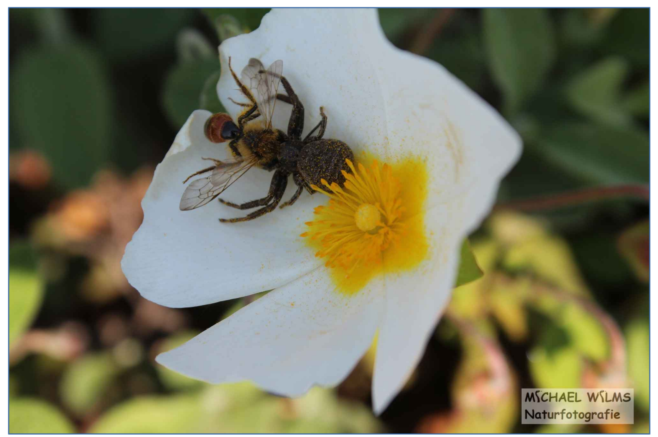
Crab spider with prey