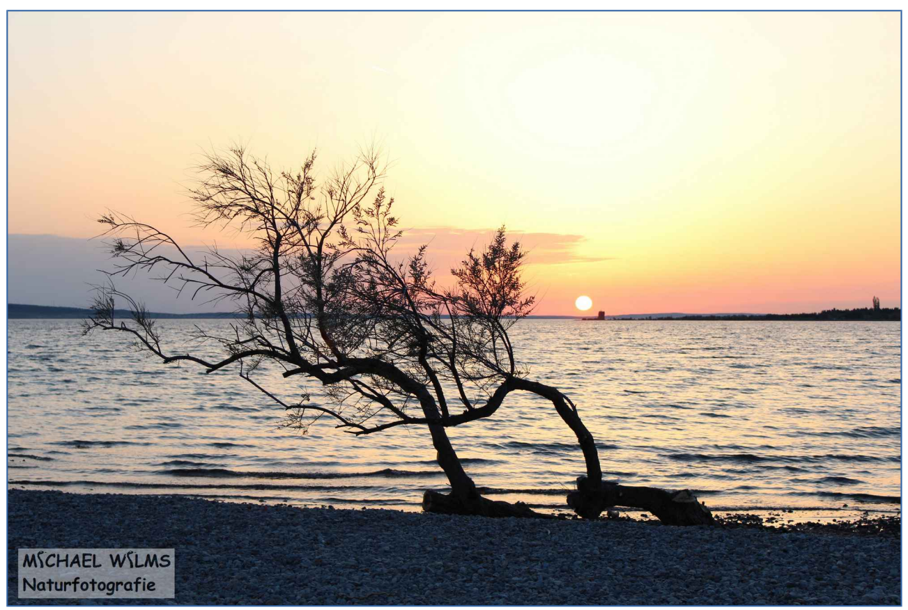
Sunset on the coast of Starigrad in front of Paklenica national park (southern Velebit mountains)