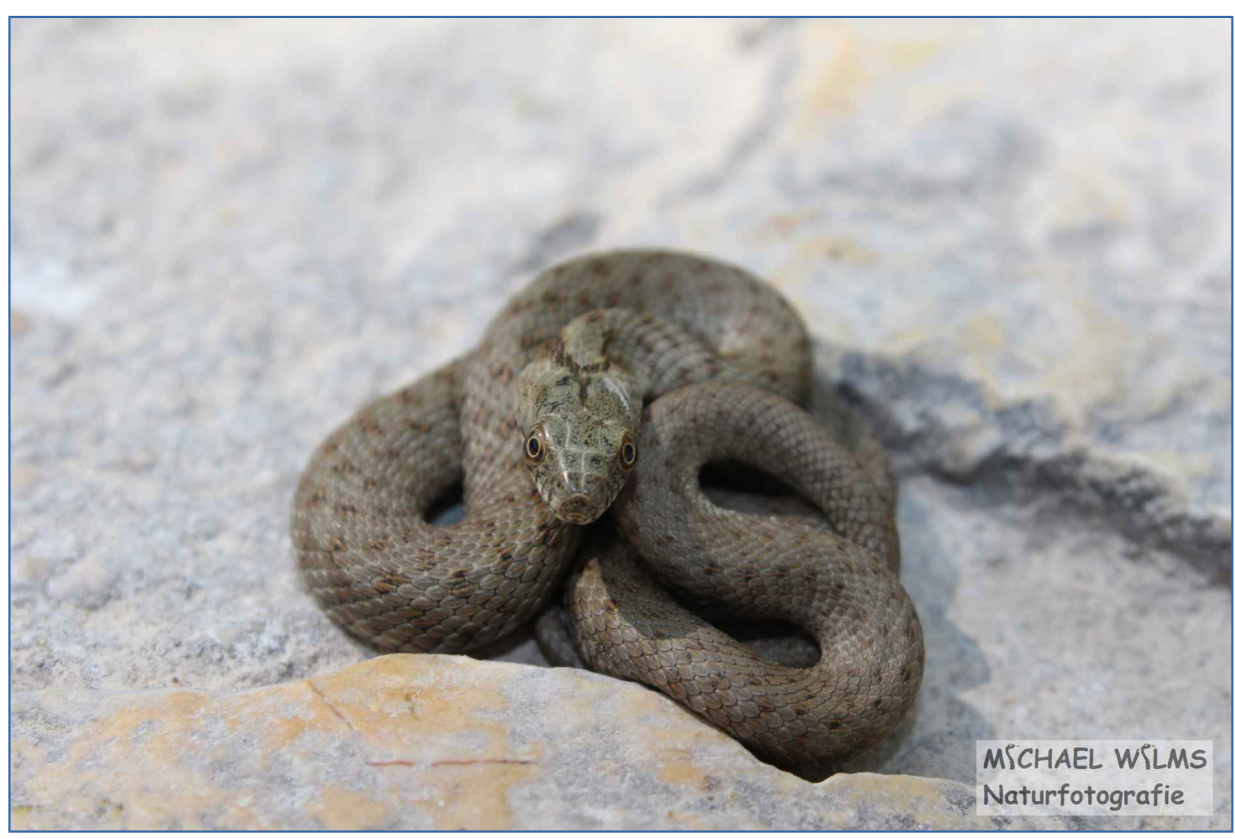
Dice snake (Natrix tesselata), baby