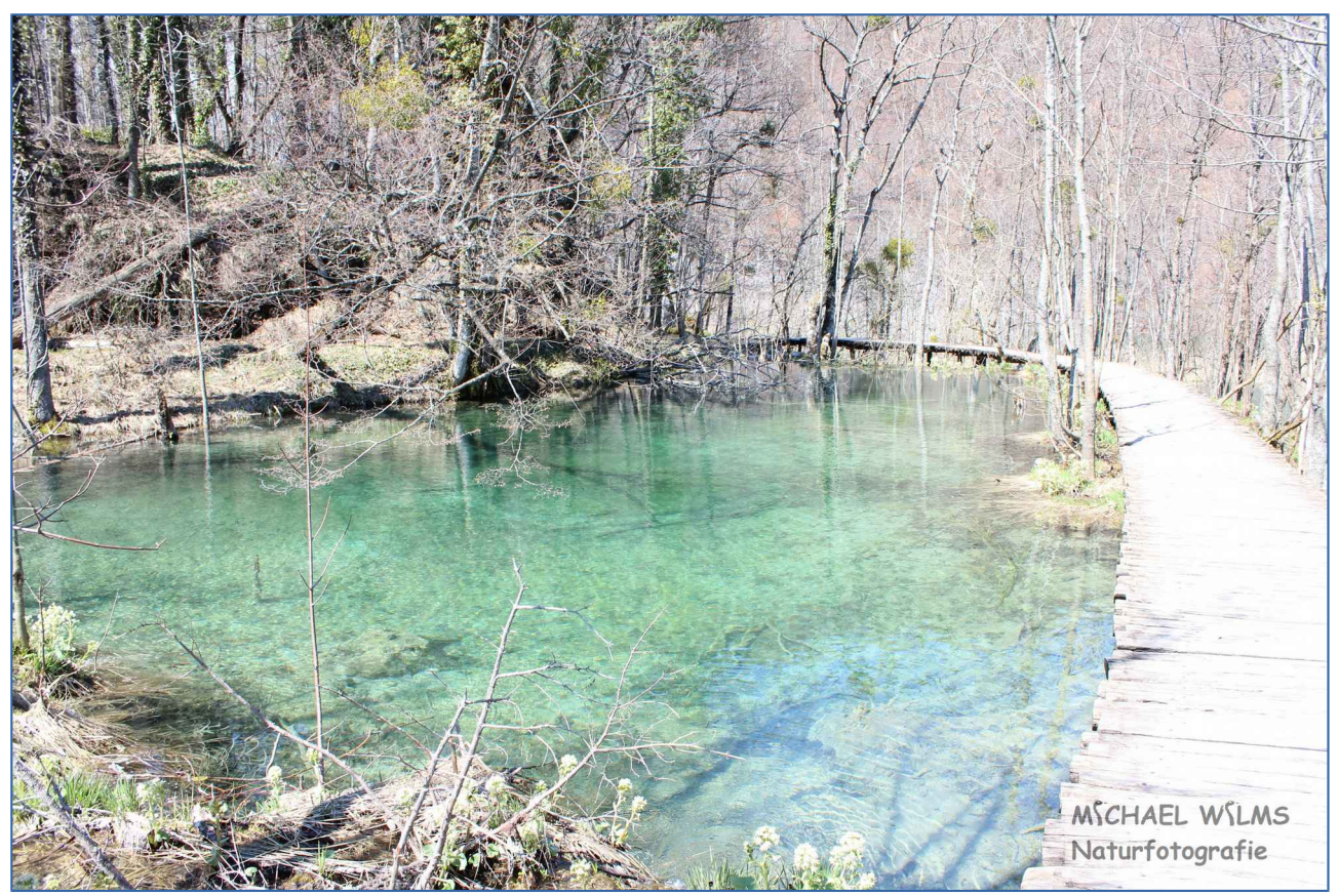
National park Plitvice lakes in middle regions