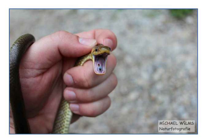
Aesculapian snake (Zamenis longissimus), caught attended to a national park ranger