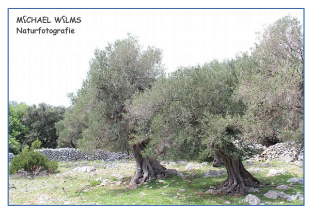
The 1000 year old olive trees on the peninsula Lun (Island Pag) surrounded by stone walls, a habitat for many reptiles