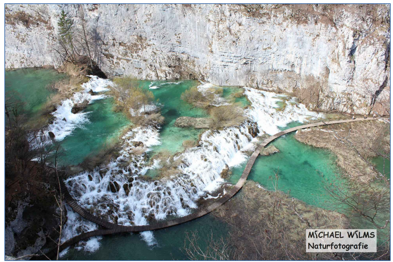
National park Plitvice lakes in April, in the lower regions are some footbridges still closed because of the much meltwater