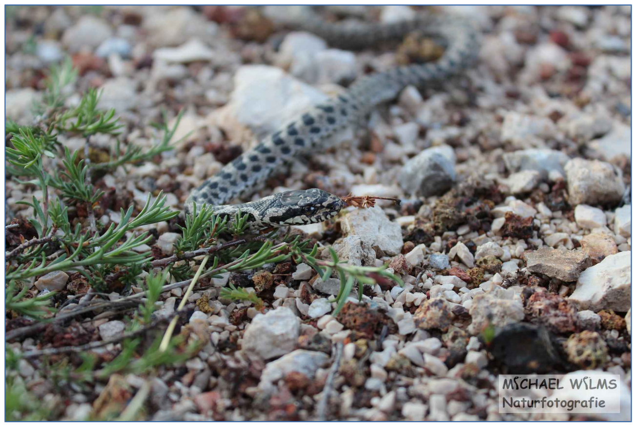
Four-lined snake (Elaphe quatuorlineata), juvenile