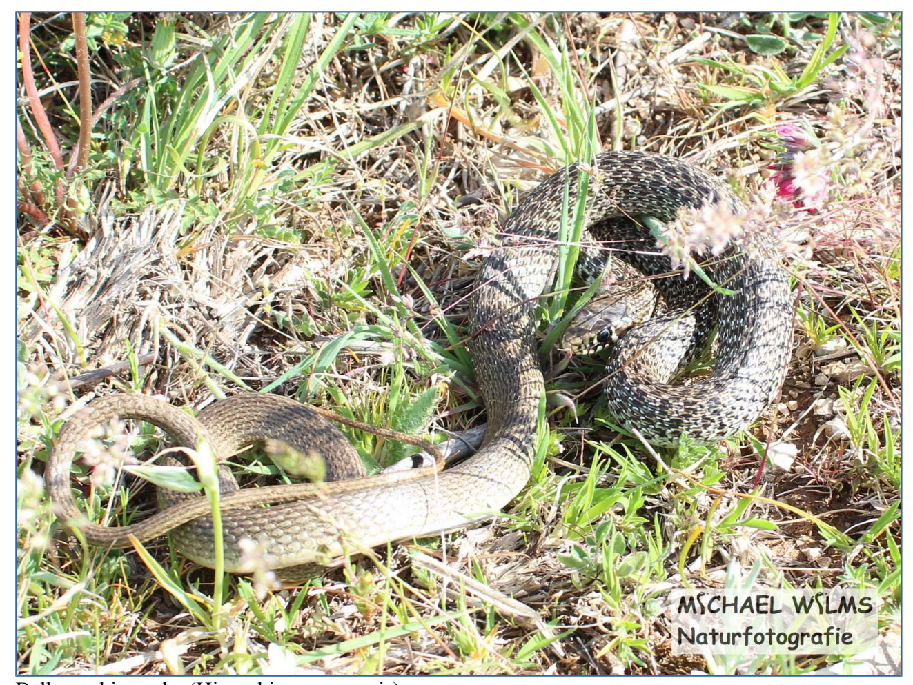
Balkan whip snake (Hierophis gemonensis)