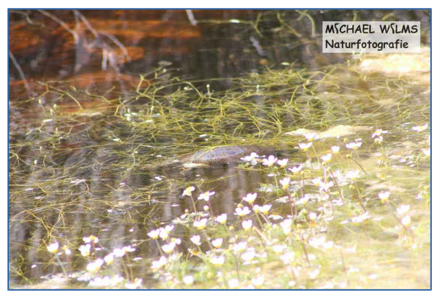
Typical habitat of the European pond turtles (Emys obicularis) on the island Pag