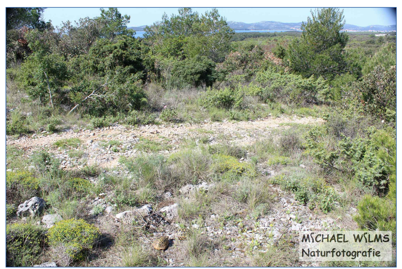
Dalmatian Hermann's tortoise (Testudo hermanni boettgeri) in it's habitat