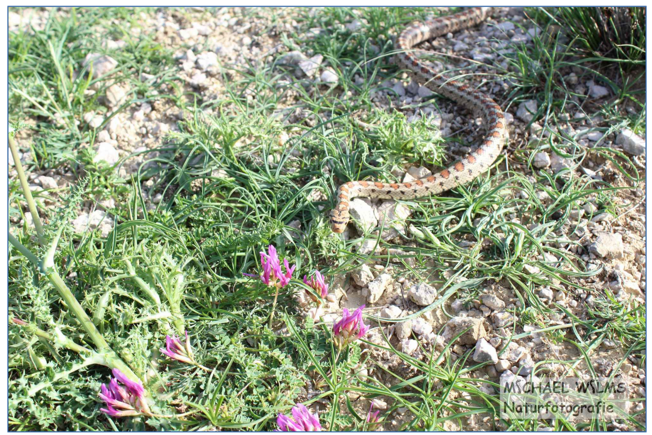
Leopard snake (Zamenis situla) on the island Pag