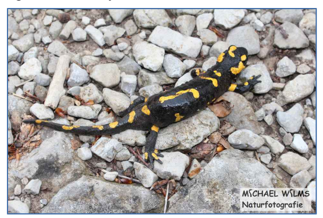
Fired salamander (Salamandra salamandra), gravid female in Paklenica national park